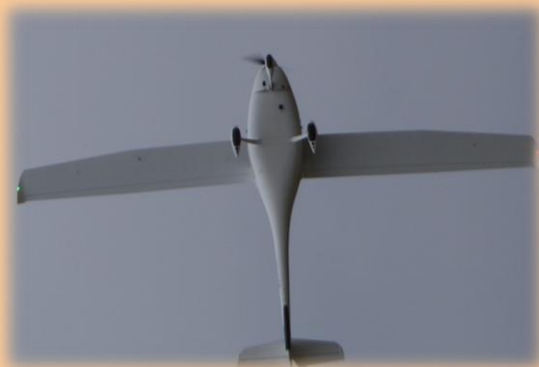
Virus S-Wing in a climb, yes a steep climb!

My interest in Motor Gliders was sparked at Sun n Fun 2002 when I first saw the Pipistrel Sinus. Clean lines, superb workmanship, reasonable pricing, and incredible performance numbers made me a believer. Since then I've made several trips to the Factory, flown and loved the Sinus, Virus, and Taurus; but could not figure out how to include these experimental designs in the SALSA business model which I had been developing for several years. Now, all that has changed.