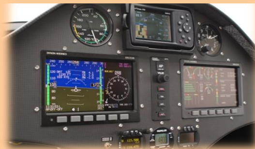
Glass Panel in the Pipistrel Virus S-wing!

Effective immediately, we are offering the impressive five model lineup built by this superb Slovenian manufacturer. Our Demonstrator /Trainer will be the Virus – a touring motor glider with performance between the thermal happy Sinus and the speedy Virus S-Wing. Also available are the outstanding self-launch Taurus (two place) and Apis/Bee (one place) high performance (L/D 40:1) birds. All are available as Experimental Kits, Experimental Factory Built, and S-LSA. Pipistrel builds the highest quality and most eco efficient aircraft on the planet. Let us help you configure the ideal model for your flying passion and budget. We are actively looking for Select Partners to help us grow Pipistrel sales.